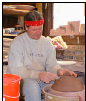
See Potters Spotlight on page 3.