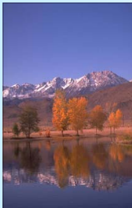
Have a Great Fall!