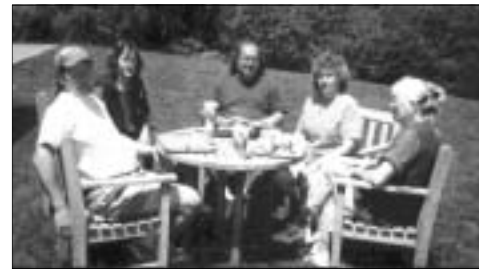
The Crew from the Cape...